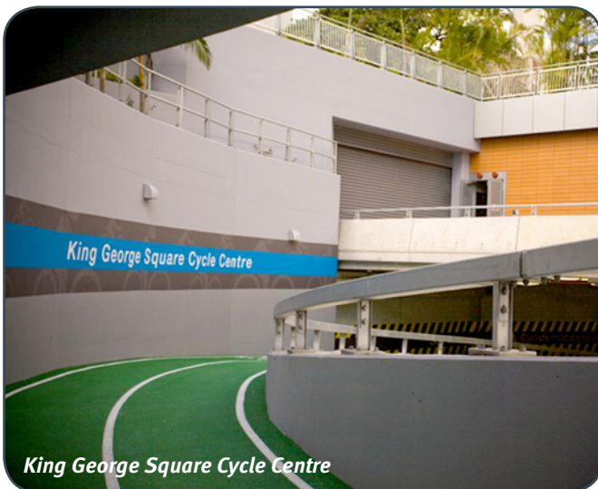
King George Square Cycle Centre