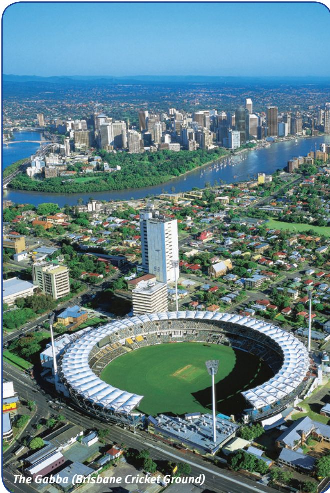
The Gabba (Brisbane Cricket Ground)