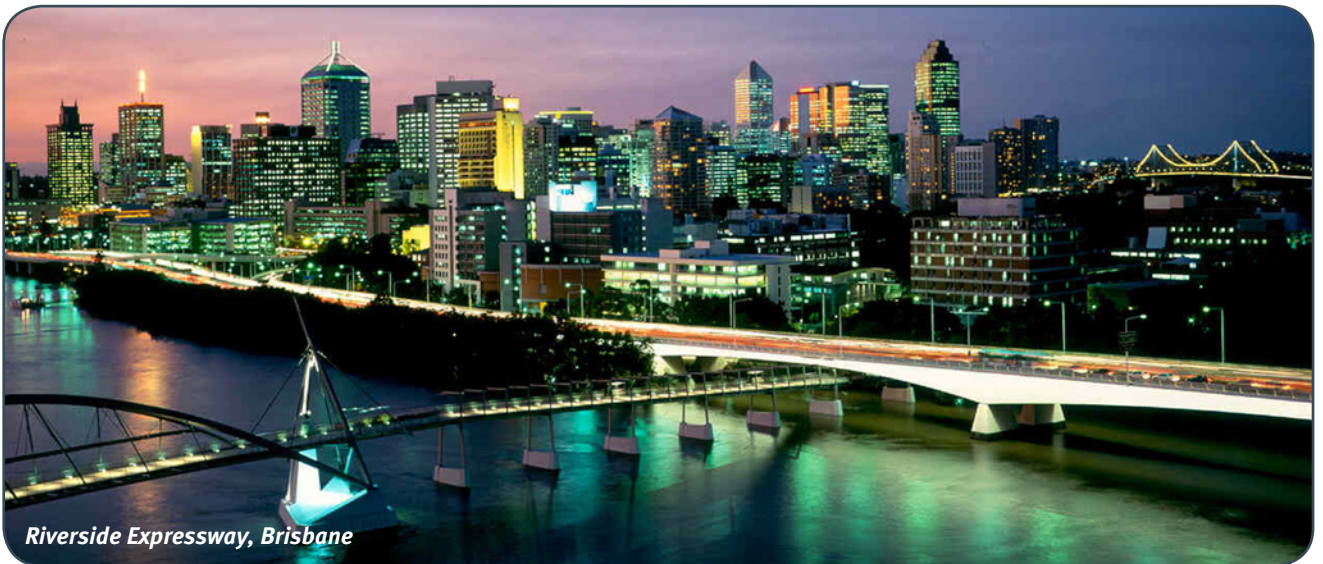
Riverside Expressway, Brisbane