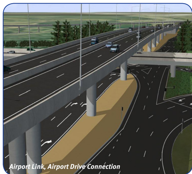
Airport Link, Airport Drive Connection